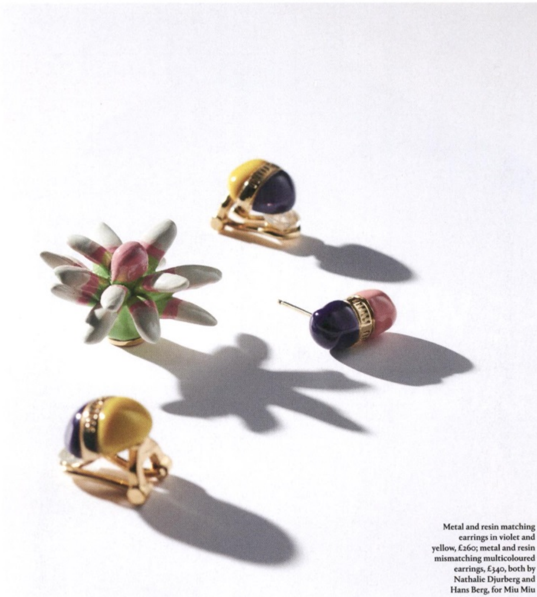
Metal and resin matching earrings in violet and yellow, £260; metal and resin mismatching multicoloured earrings, £340, both by Nathalie Djurberg and Hans Berg, for Miu Miu

flamboyantly-drawn silhouettes of earrings and necklaces are translated into childlike forms. The resulting offbeat pieces offer a new look to traditional fine jewellery, imbuing animals and flowers with an impish impression when juxtaposed against a rainbow of boldly coloured pills. Polished, assembled and decorated by hand, their gleaming outlines make for a chic bridge between the art and jewellery worlds. miumi.com