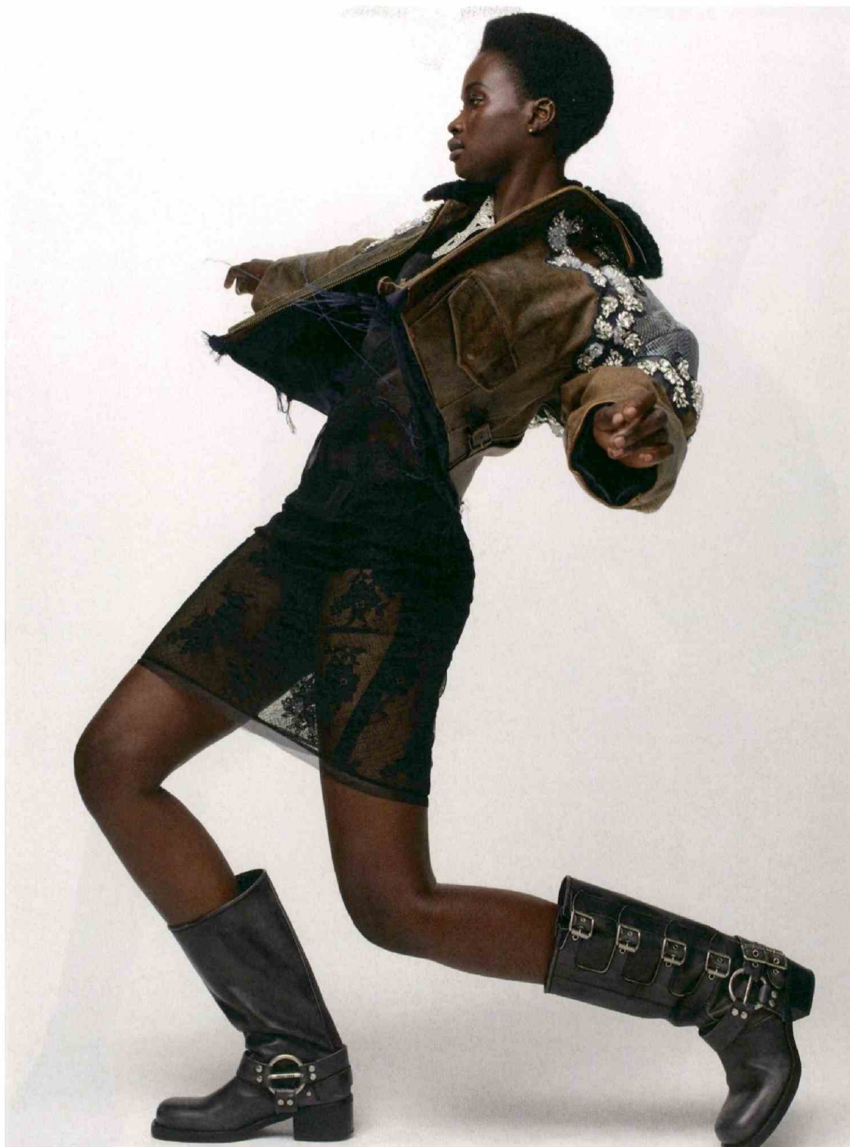
GRAN BRETAGNA - ELLE - MIU MIU - 01.11.22