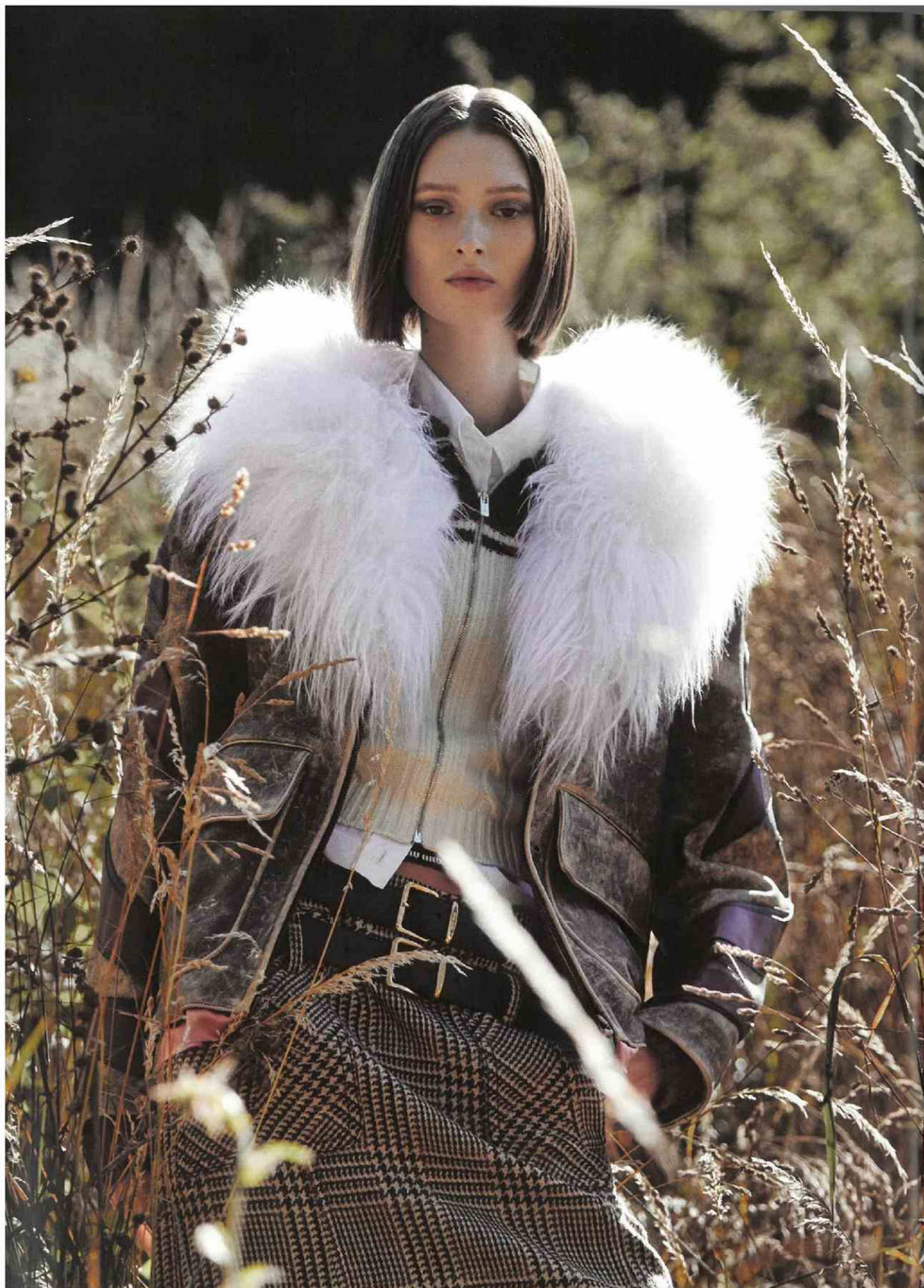
RUSSIA - MARIE CLAIRE - MIU MIU - 01.10.2022